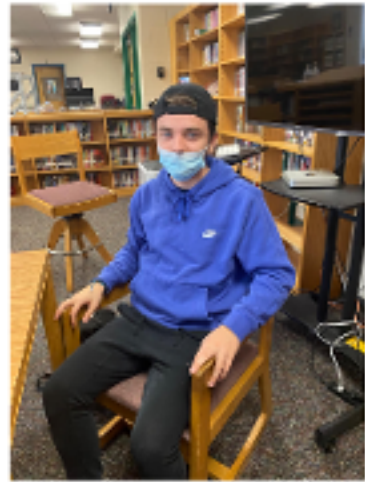
"Honey Bunches of Oats" - Nick Bondi